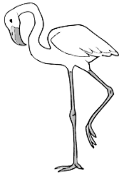
F ____ amin ____ o