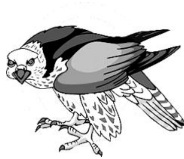
E ____ gl ____